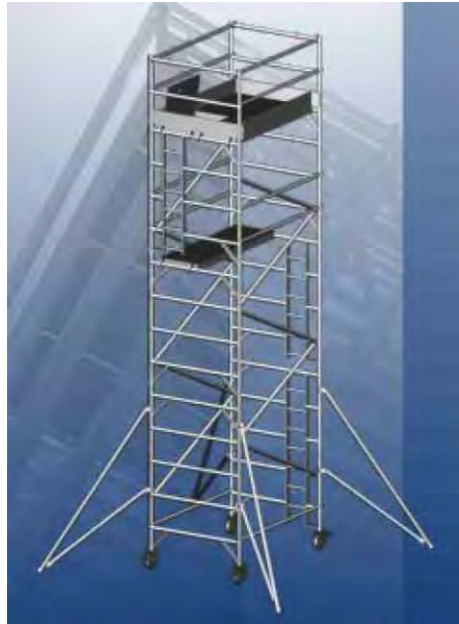
Aluminum Tower Series 100 Length: 2m Width: 1.35m