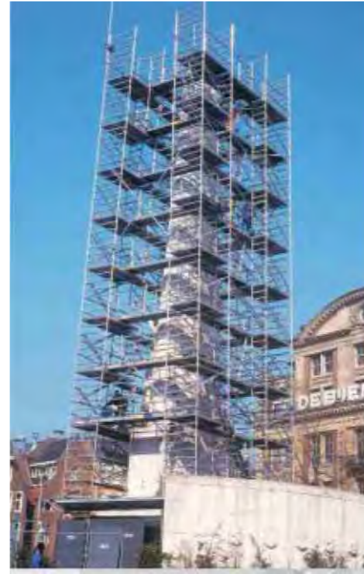
Optionally assorted Aluminum Tower