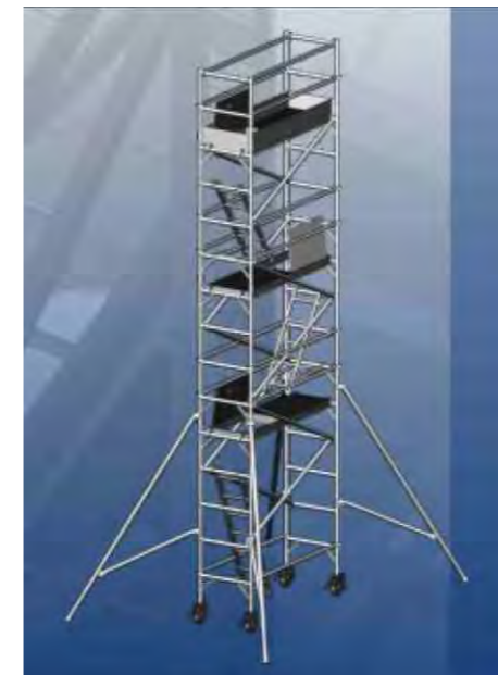
Aluminum Tower Series 600 Length: 2m Width: 0.75m