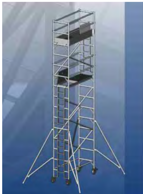
Aluminum Tower Series 200 Length: 2m Width: 0.75m