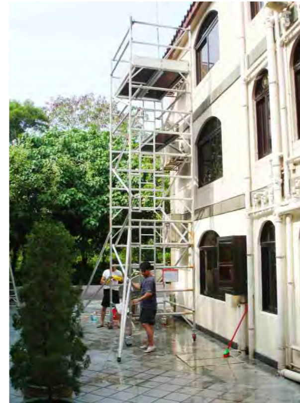
Applicable for exterior refurbishing