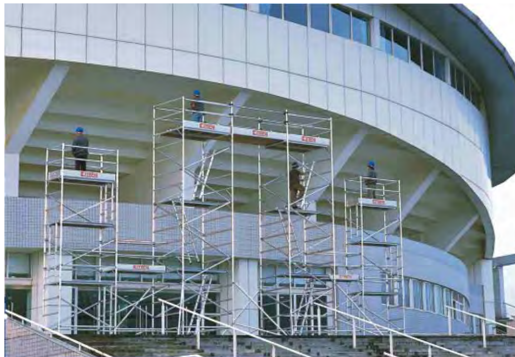
All the towers can be connected together for multi-purpose