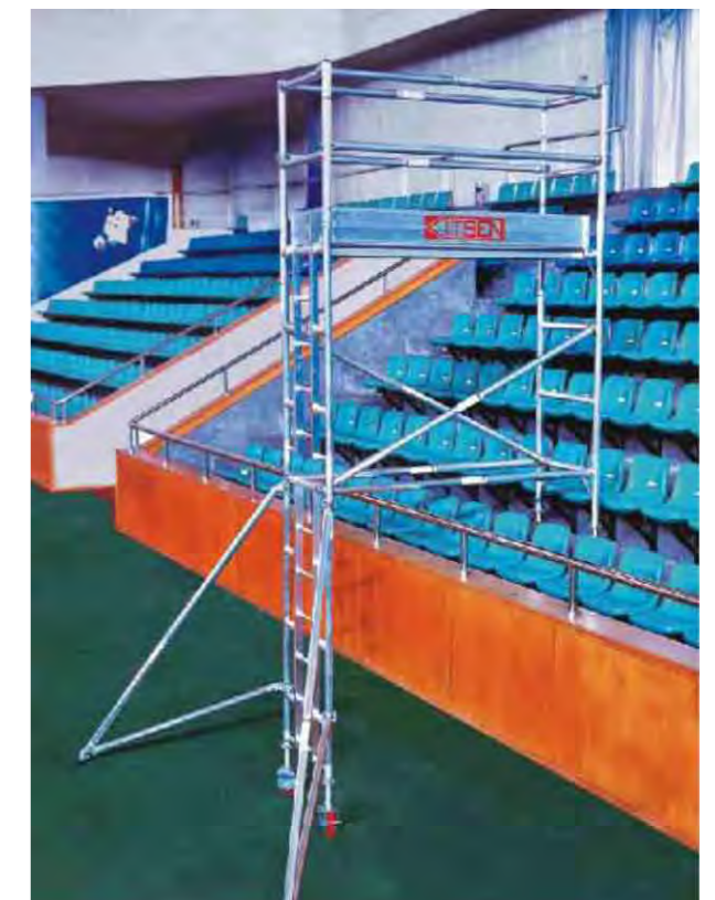
Adjustable for unlevel purpose