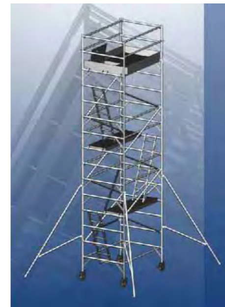
Aluminum Tower Series 500 Length: 2m Width: 1.35m