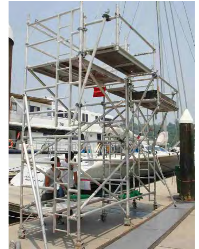
Special tower for yacht maintenance