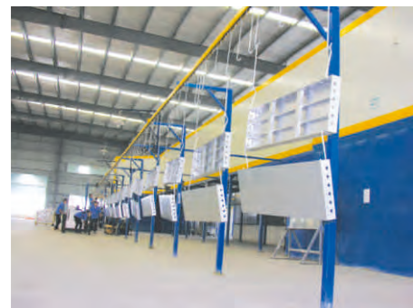
Automatic Surface Treatment Line