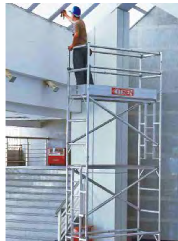
Applicable for interior refurbishing