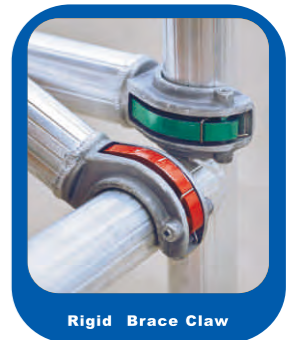
Rigid Brace Claw