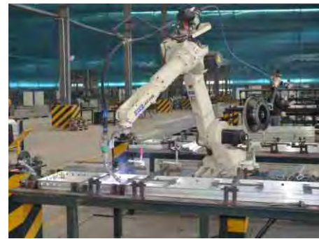
Robotic Welding Workshop