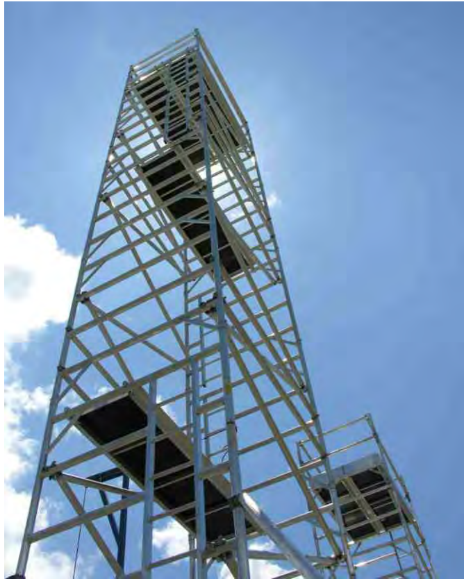
Aluminum Tower Combination up to 23m high